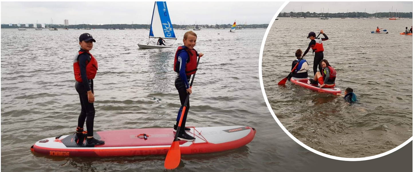
Some of the Scouts try out the new boards.