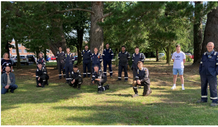
Fawley's apprentices from the 2018 cohort after successfully completing their three-year programme.