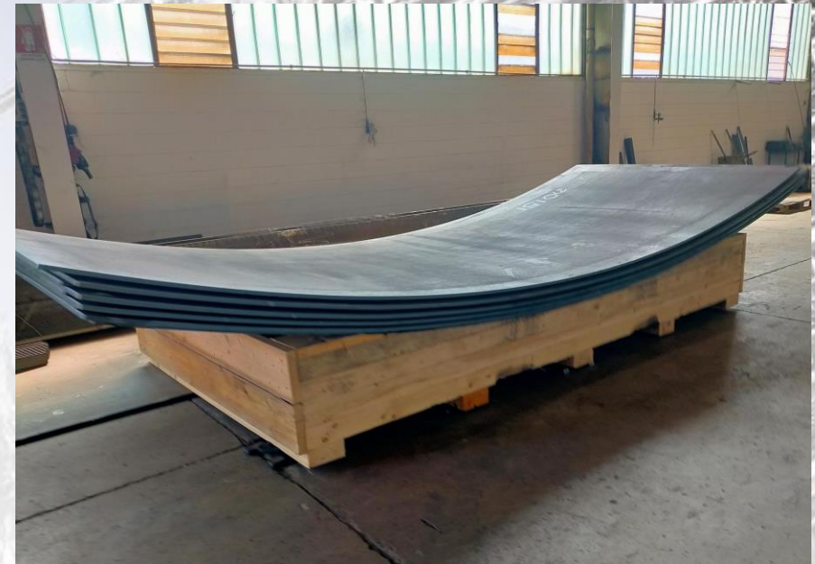
Manufacture of EGF now underway