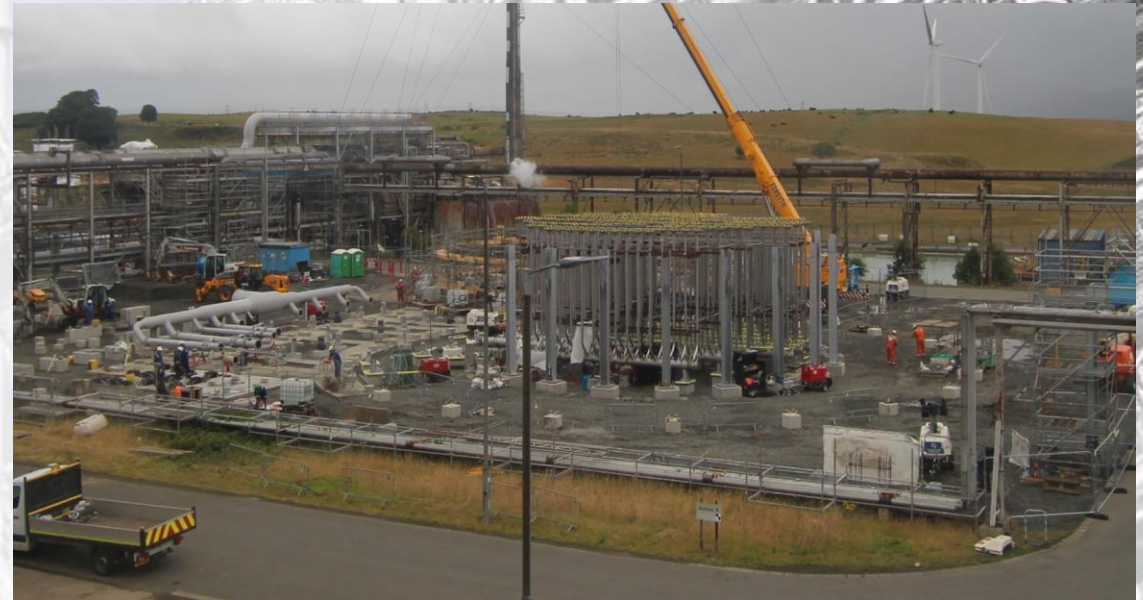
Manifold and initial spools installed